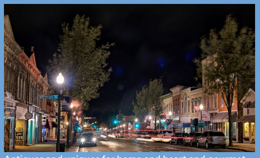
Antiques and uniques for home and heart and gourmet goods, like cheese so fresh it squeaks!