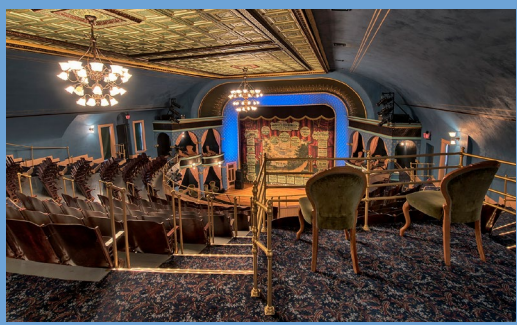
Enjoy an intimate experience in this historic venue with more than 100 various acts each year!