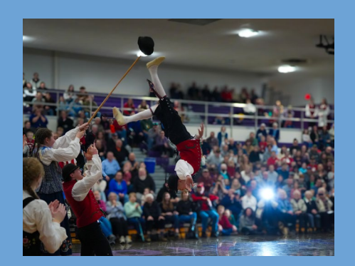
Stoughton's Goodwill Ambassadors, these high school students perform folk dances in authentic Norwegian Bunads.