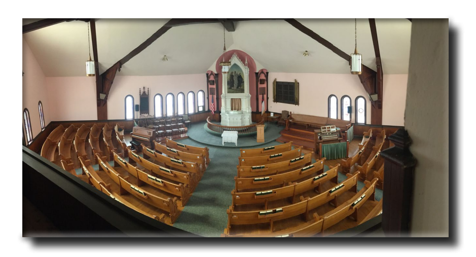
East Koshkonong Church, Cambridge