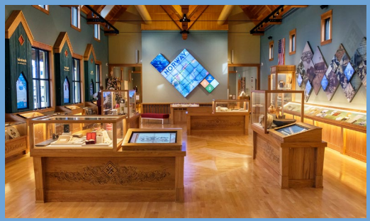
Map your own journey from Norway or learn about those who have made the trek before.