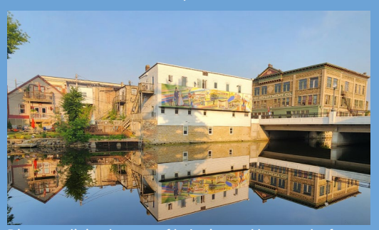
Discover dining by way of bakeries and brew pubs from dockside to downtown!